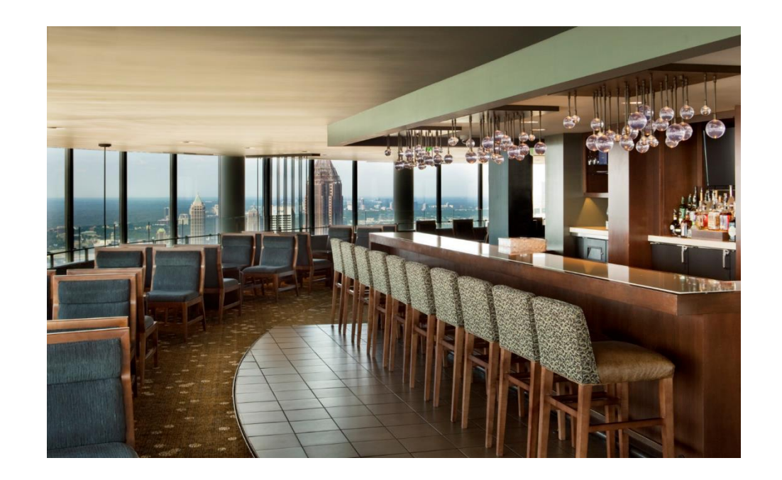
The Bar – Level 73