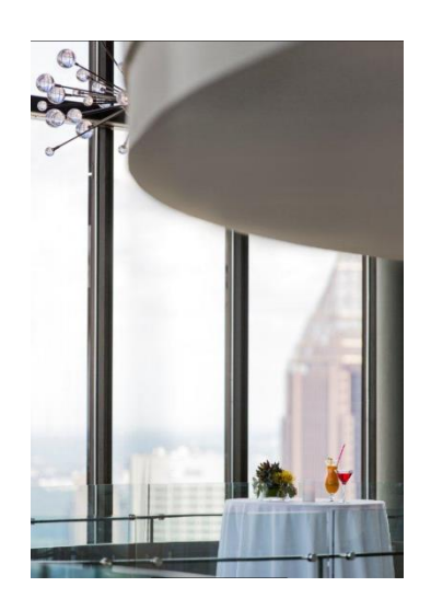
The View - Level 72